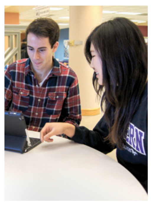
"Donor support makes it possible for us to continue to provide the exceptional services Western Libraries is known for and will also propel us to the next level."

"Academic libraries must anticipate and respond to a wide range of rapid changes in higher education, research, society and technology, such as the need for new services and the rise in digital scholarship, big data and e-learning," she said.